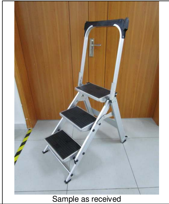
Sample as received