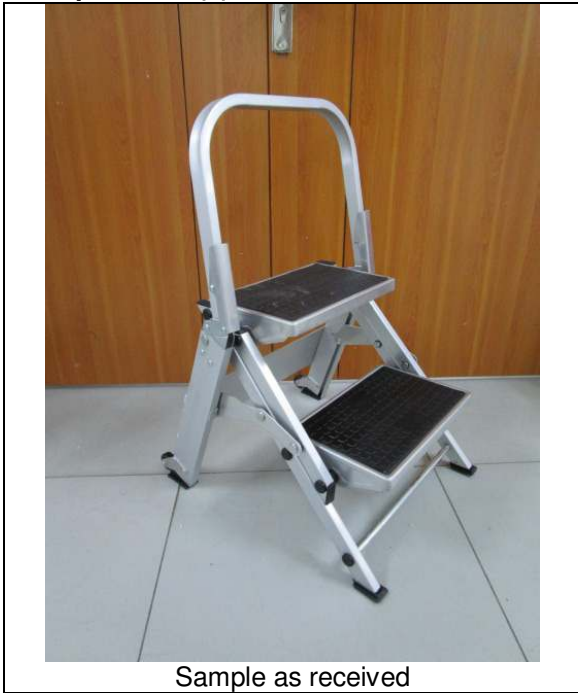
Sample as received