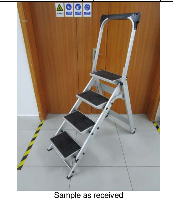
Sample as received