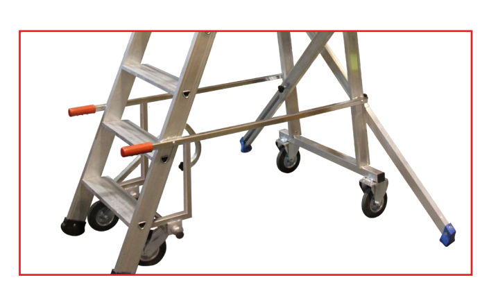
Visual with rolling arm option